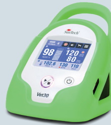
Tree Frog Green