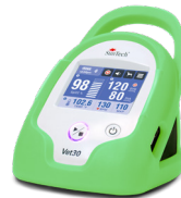
Tree Frog Green