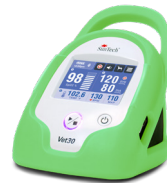
Tree Frog Green