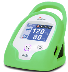
Tree Frog Green