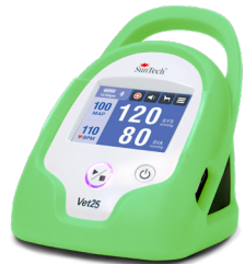
Tree Frog Green