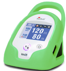
Tree Frog Green