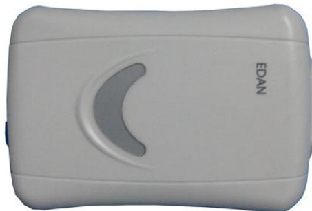
Sampling Box provided by EDAN