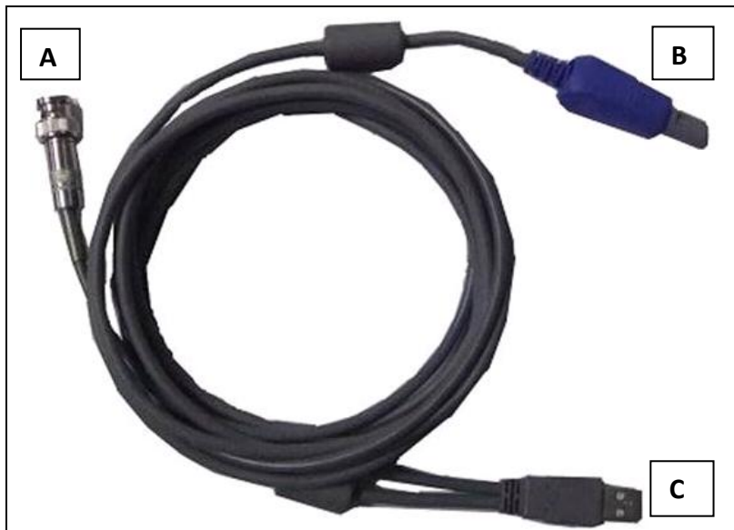
Exercise ECG cable provided by EDAN