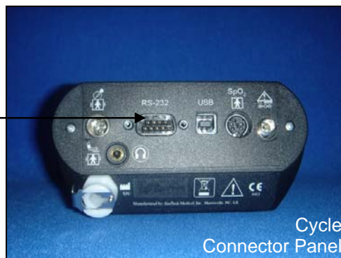
Cycle Connector Panel