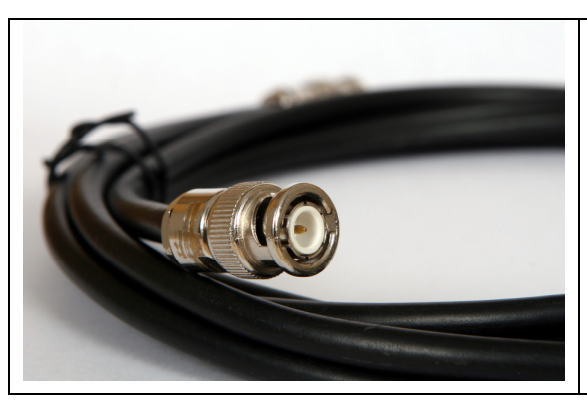
Tango+ Connection BNC male