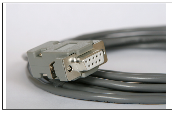
Tango+ Connection 9 pin female