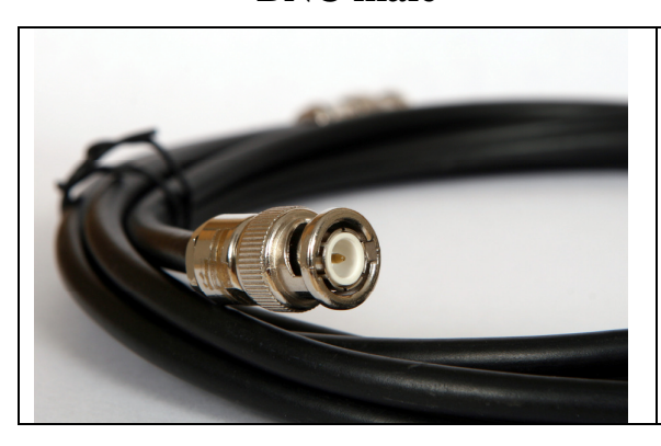
Tango+ Connection BNC male