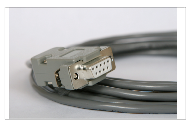
Tango+ Connection 9 pin female