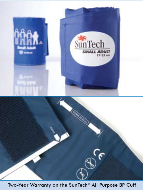
Two-Year Warranty on the SunTech® All Purpose BP Cuff

SunTech Medical®, a company with a twenty-five year history of research in blood pressure technology brings you the SunTech® All Purpose BP Cuff. Ranging from Infant to Thigh, including long sizes, SunTech's color-coded, All Purpose BP Cuffs are designed with a tapered end and an easy to clean high quality nylon that provides an outstanding combination of durability, patient comfort and longevity. SunTech's All Purpose BP Cuffs are durable enough to sustain multiple blood pressure measurements on multiple patients in the widest variety of clinical applications and environments.